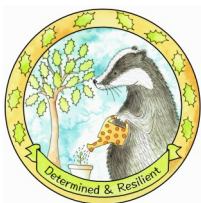
Bramble the Badger