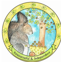
Speedwell the Squirrel