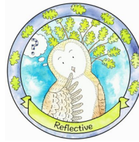
Oakley the Owl