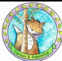
Fern the Fox