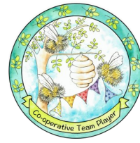
The Busy Bees