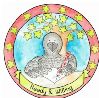
Rowan the Raven