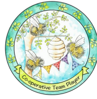
The Busy Bees