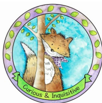
Fern the Fox