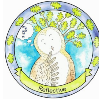
Oakley the Owl