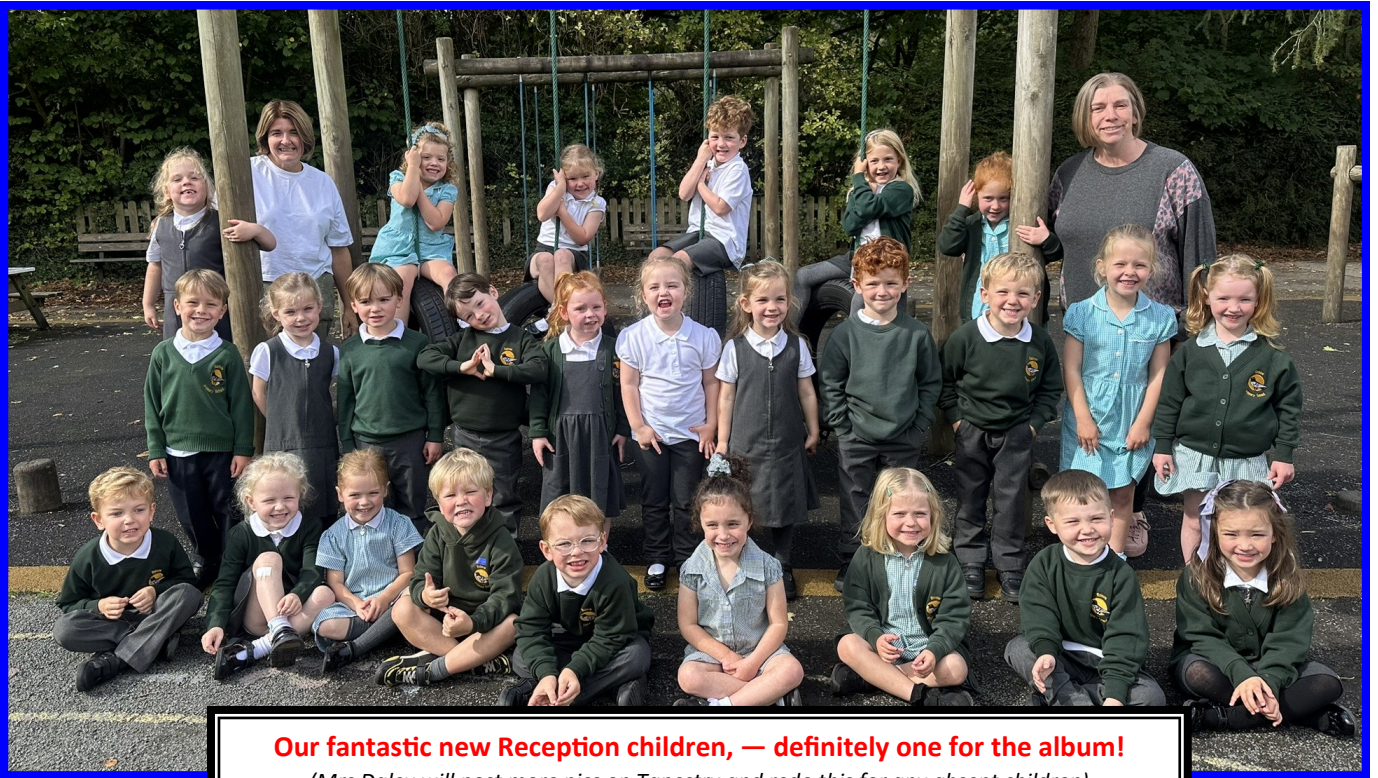
Our fantastic new Reception children, — definitely one for the album!

We have enjoyed an excellent first week back. The children have been impeccably behaved, happy, and clearly delighted to be back together. The first week is always about re-establishing routines and rebuilding stamina after a long break, so I imagine the children (and staff!) will be feeling ready for a restful weekend. Wishing you all a relaxing and enjoyable couple of days.