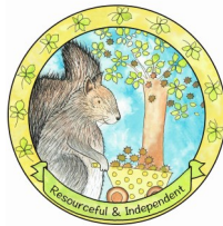
Speedwell the Squirrel