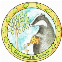
Bramble the Badger