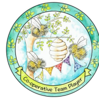
The Busy Bees