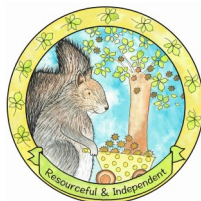
Speedwell the Squirrel