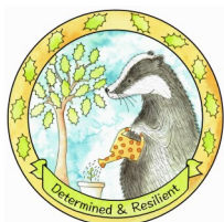
Bramble the Badger