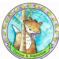
Fern the Fox