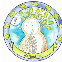
Oakley the Owl