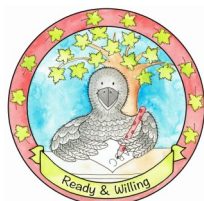
Rowan the Raven