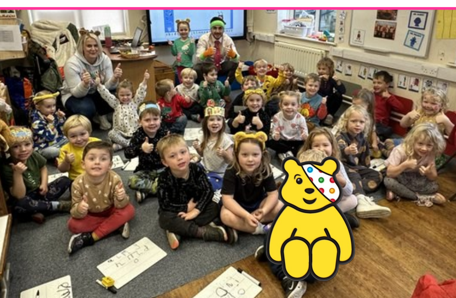
Left: Y4 wrote some emotion porty around he idea of kindness and love: definitely anti-bullying Right: The Reception Class enjoyed their first Rainow Children in Need day.